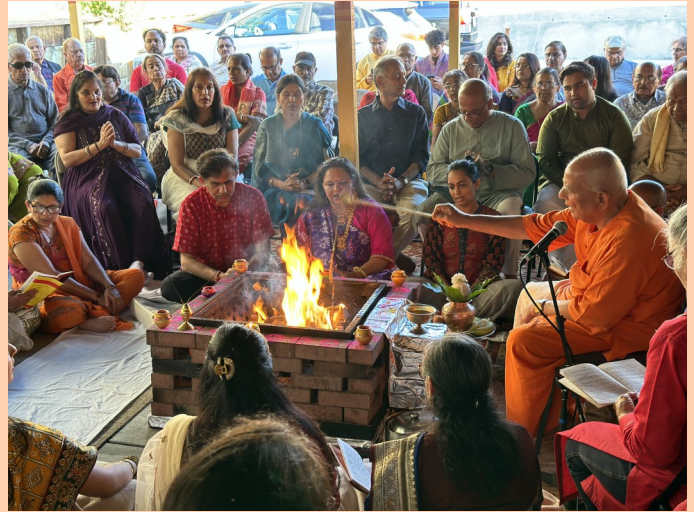
Navaratri Sri Durga Homa